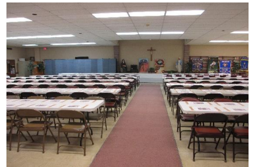
COMPLIMENTARY LUNCH RECEPTION MCMANUS HALL

Special thanks to the Women's Guild who prepared conscientiously and deliciously our meal and beautifully arranged the Hall for the occasion.