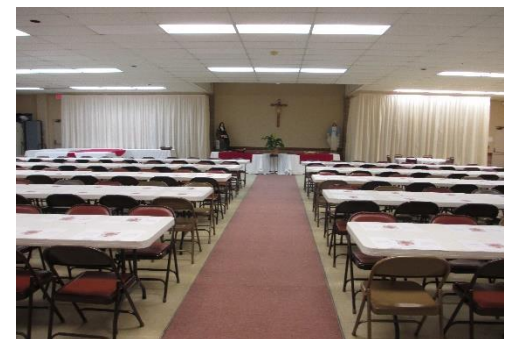
COMPLIMENTARY LUNCH RECEPTION

Special thanks to the Women's Guild who prepared conscientiously and deliciously our meal and beautifully arranged the Hall for the occasion.